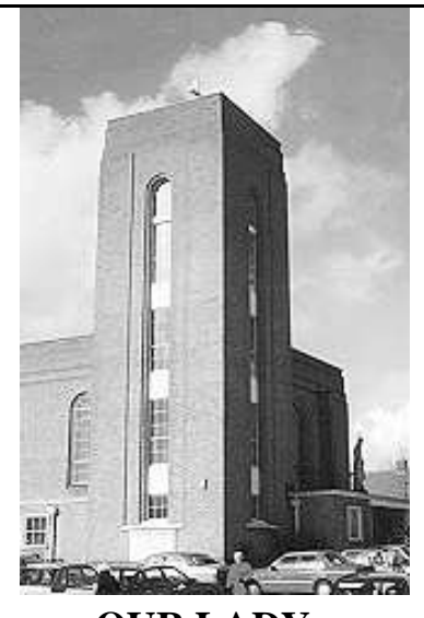
OUR LADY, QUEEN OF APOSTLES